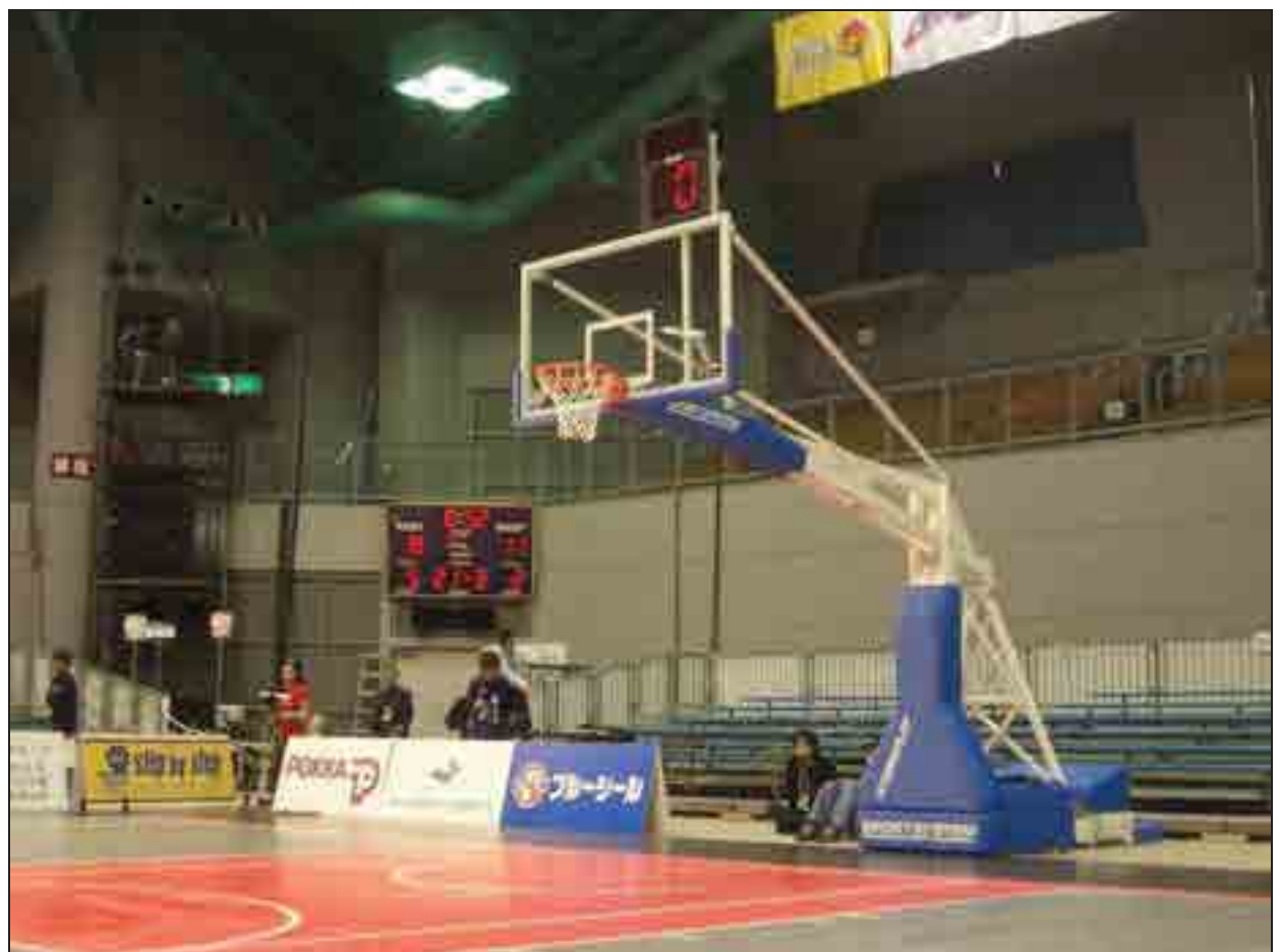
Okinawa - Japan