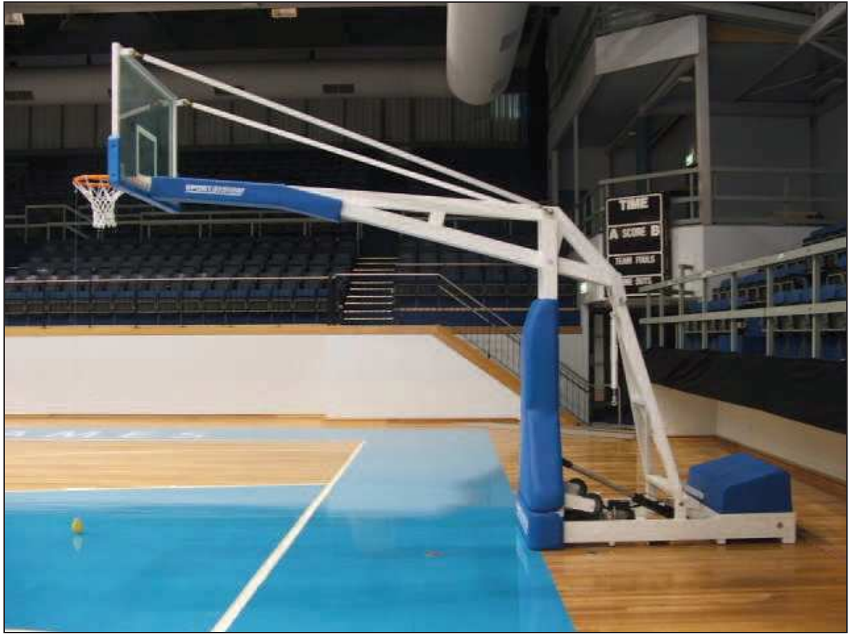
Geelong Arena - Australia