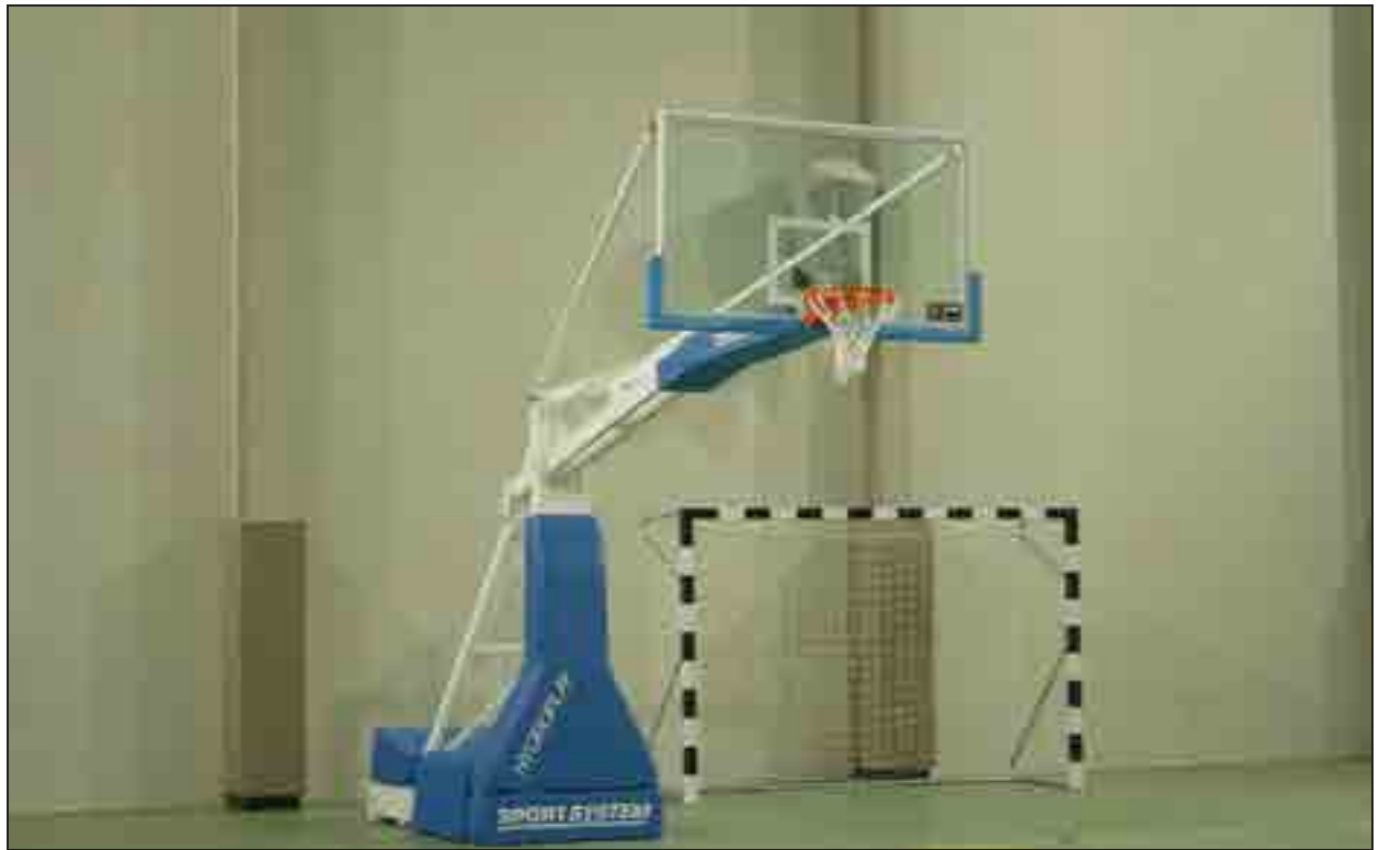
Doha – Qatar