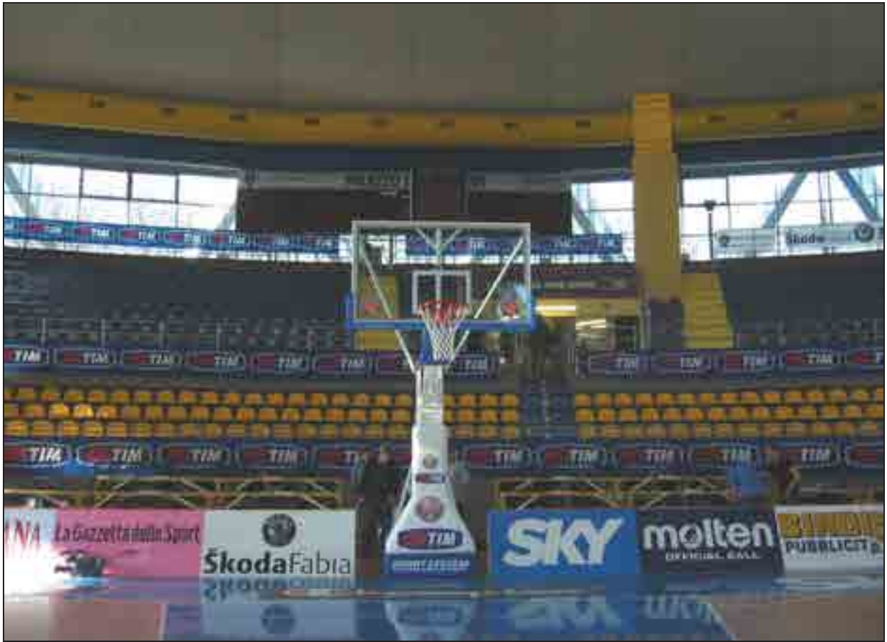
Turin - Italy